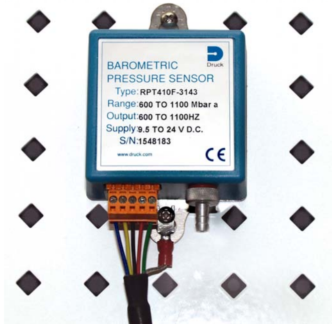
FIGURE 3-1. Mounting CS115

The mounting holes for the sensor are one-inch-centered, and will mount directly onto the holes on the backplates of the Campbell Scientific enclosures. Mount the sensor with the pneumatic connector pointing vertically downwards to prevent condensation collecting in the pressure cavity, and also to ensure that water cannot enter the sensor.